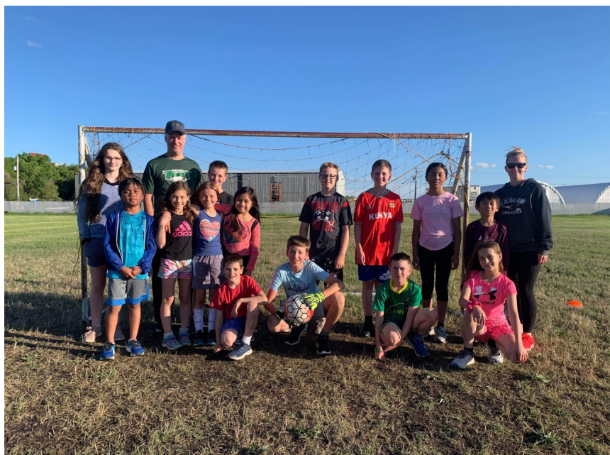
Englefeld Junior Soccer Team—Grade 3-5 students enjoyed 6 weeks of soccer in June. The short season included 2 games against Quill Lake. Englefeld was victorious in both!